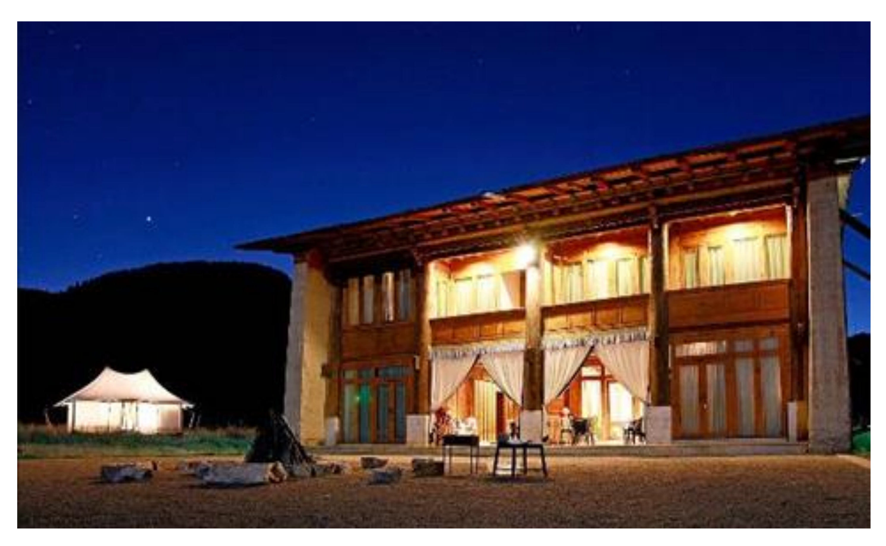
Living spaces open onto outdoor terraces, bordered by panoramic mountain views.